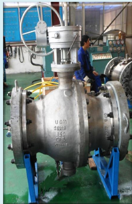
20 inch Stainless Steel Trunnion Ball Valve