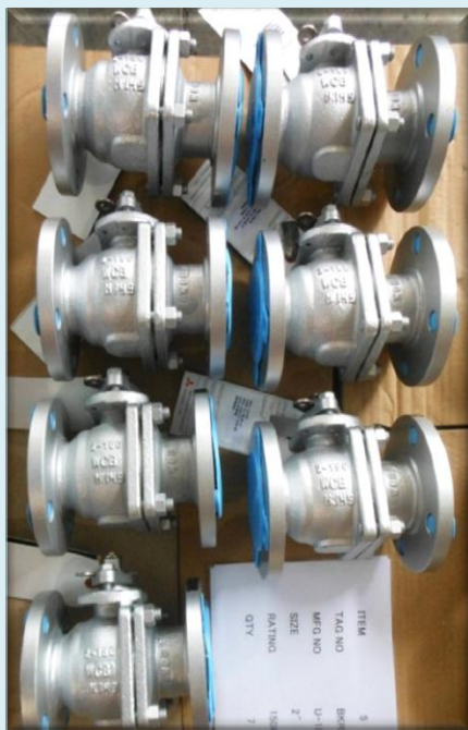
Carbon Steel Ball Valves